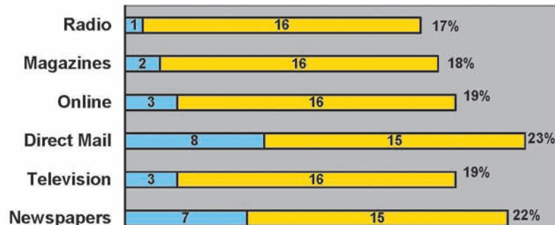
Chart shows how additional customers can be reached by adding Yellow Pages to your media mix

■ % of individuals who use the medium ■ Extended reach by adding Yellow Pages