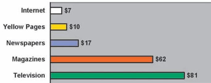
Cost Per Client Influenced:

You pay less per customer for Yellow Pages than you pay for most other advertising media. (CRM, Associates, 2001).