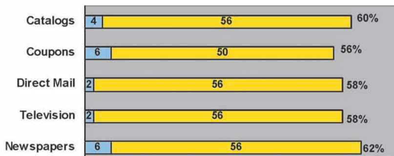
Chart shows how additional customers can be reached by adding Yellow Pages to your media mix

■ % of individuals who use the medium ■ Extended reach by adding Yellow Pages